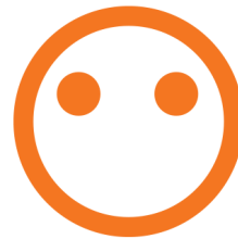
People per hour