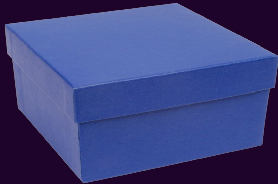
Limited Liability Company (LLC)

Each box represents a different type of business entity