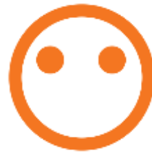
People per hour